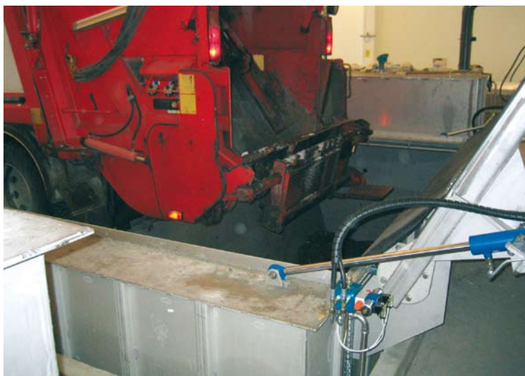
Dumping of household waste in a receiving unit from Läckeby Products.

The Läckeby Products receiving unit is designed for heavy waste. Several individually driven bottom screws of carbon steel ensure a good mixture of all kinds of waste. The receiving unit is made of stainless or acid proof steel and designed to fit the customer's requirements regarding volume, space limits and dumping vehicles. The hatch is provided with hydraulic cylinders for opening and closing.