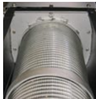
Screw presses from Läckeby Products are fitted with an inspection hatch for the press unit, and replaceable press pipes.

The press unit is equipped with an inspection hatch to make maintenance simpler and enable flushing of the press pipe. Flexible attachment of the press pipe in the press unit makes press pipe replacement easier. The spiral is fitted with a brush at the drainage to minimise the risk of clogging. As standard, screw presses are made in stainless steel or acid-proof steel with Hardox wear bars. Spirals are made of black material as standard, but are also available in stainless steel.