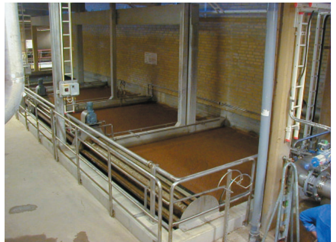
DAFRapide® at Nymölla pulp & paper mill, Nymölla, Sweden